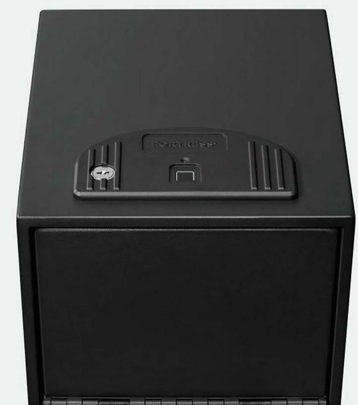
Fortress Large Quick Access Safe with Biometric Lock