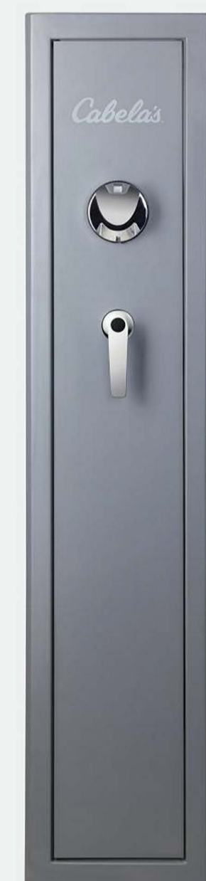
Cabelas 4 Gun Safe with Biometric Lock

The above safes were sold from 2018-2023