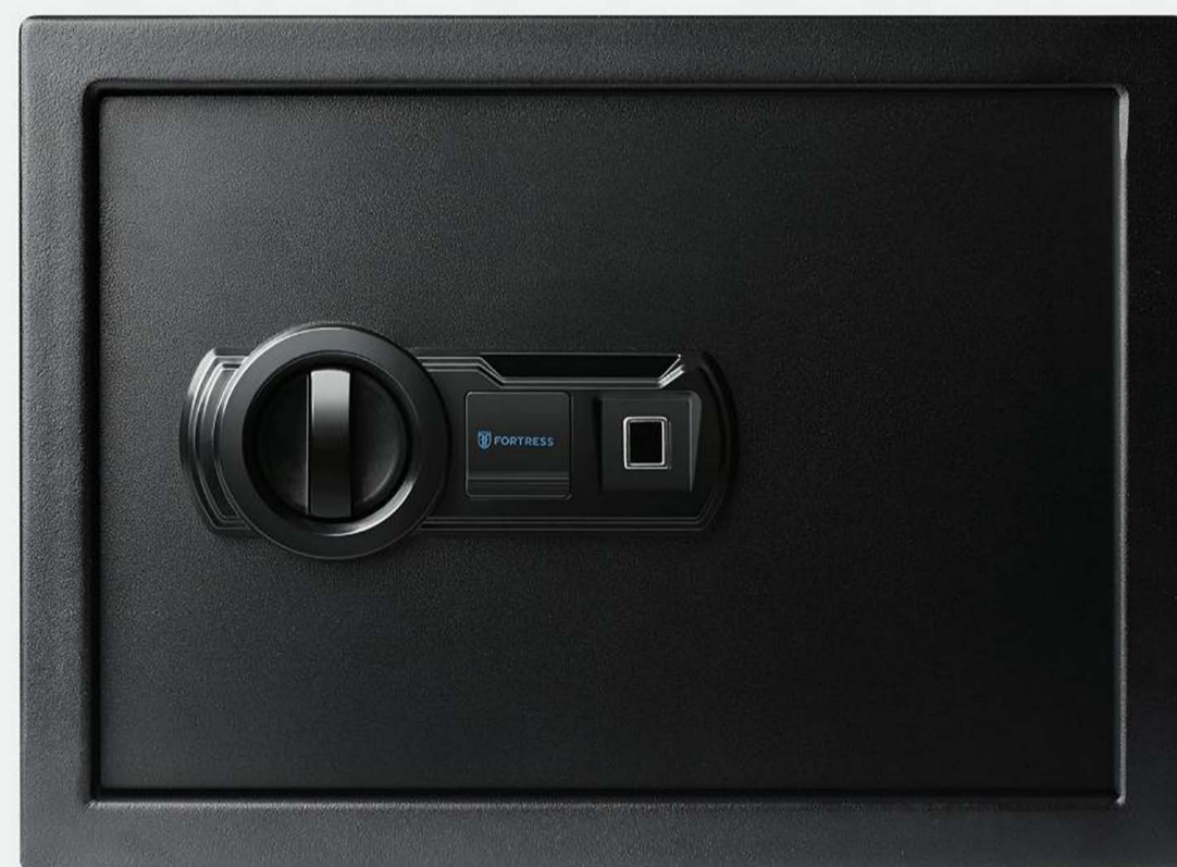
Fortress Medium Personal Safe with Biometric Lock