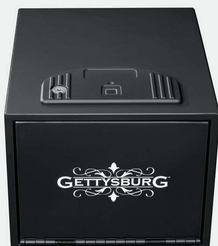
Getysburg Large Quick Access Safe with Biometric Lock