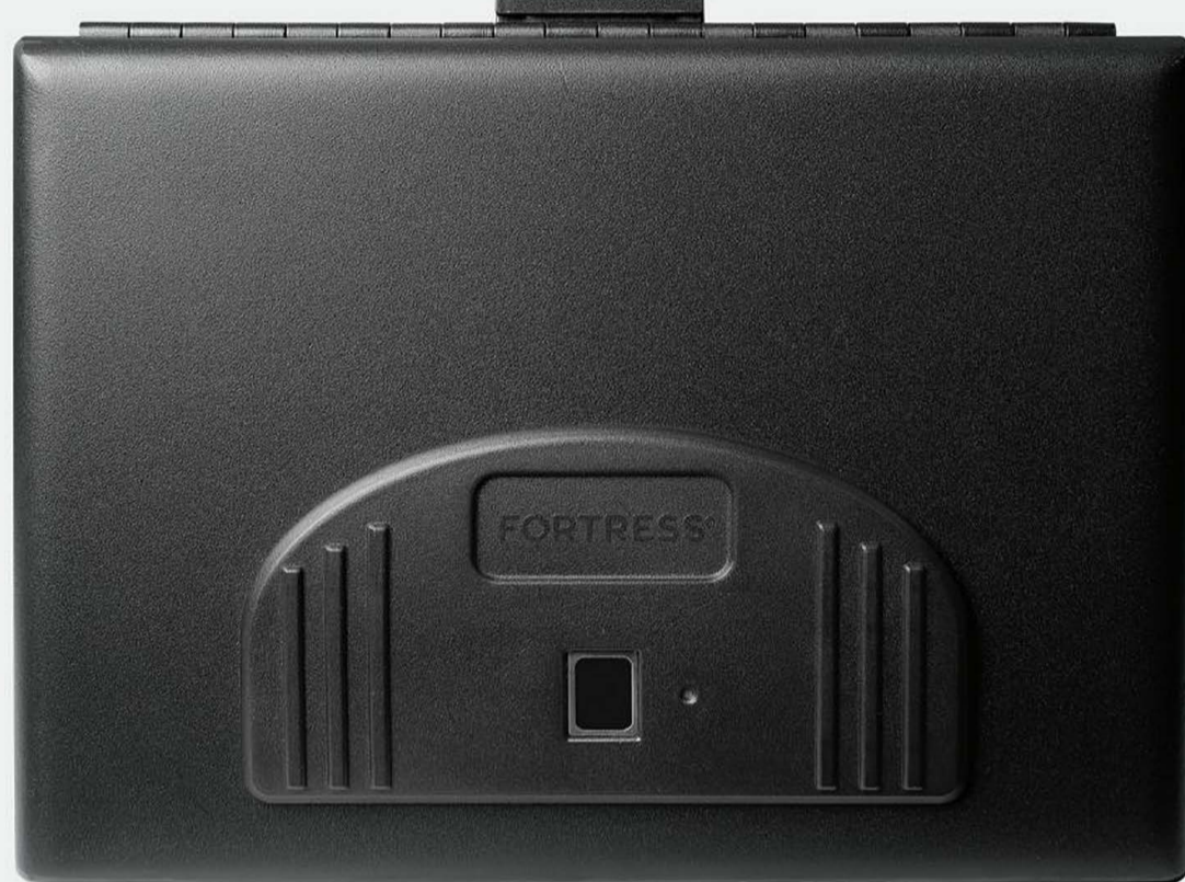
Fortress Portable Safe with Biometric Lock