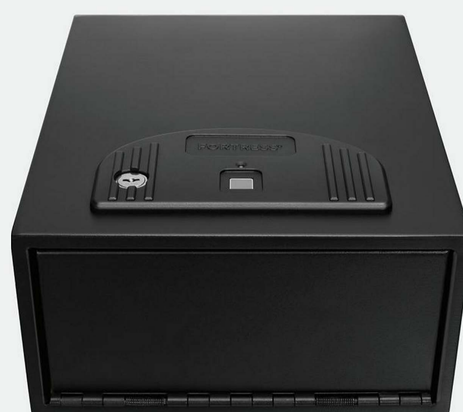
Fortress Quick Access Safe with Biometric Lock