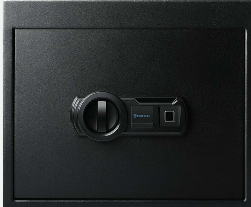
Fortress Personal Safe with Pop up door and Biometric Lock